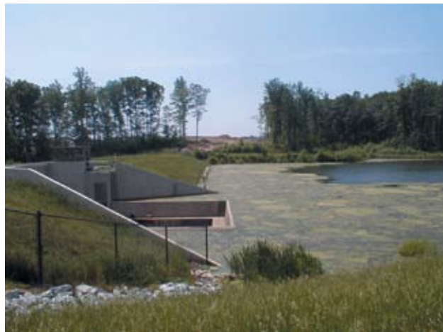
This algae bloom in a North Carolina retention pond was growing at a rate of several feet of surface diameter per hour. Differentiating between these algae and potentially harmful cyanobacteria—and tracking the blooms throughout the water column—helps drinking water plant operators select intake levels and treatment strategies to ensure healthy, good-tasting water.

Some cyanotoxins were detected, but peak levels during the drought of 2002 were 0.8 µg/L, below the World Health Organization 1.0 µg/L standard for human health, according to Elle Allen, a CAAE research specialist.