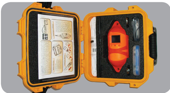
Rugged CastAway-CTD storage case